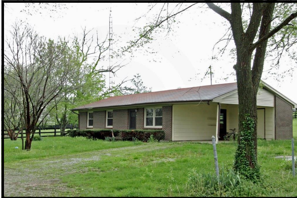
535 West Second Street, Ste. 104 Lexington, Kentucky 40508 www.KirkFarms.com